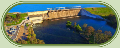
Lake Hume & Hume Dam

AUSTRALIA'S BEST KEPT SECRET IS VICTORIA'S HIGH COUNTRY